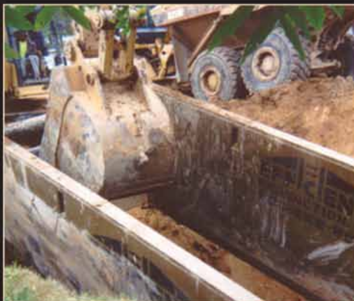
Steel Trench Shields