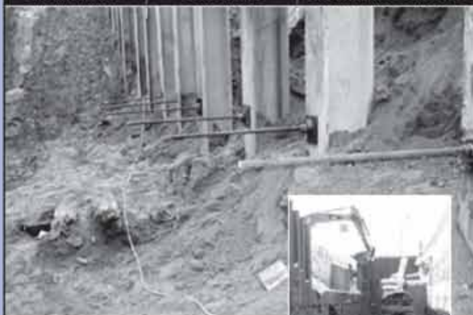
I-696 RETAINING WALL RECONSTRUCTION

"G2 gets our highest recommendation for geotechnical and construction quality services on projects of any size"