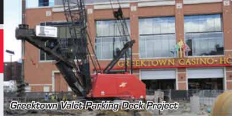
Greektown Valet Parking Deck Project

our major areas of operation are Michigan, Ohio, Indiana, Illinois, Pennsylvania, Kentucky and Tennessee.