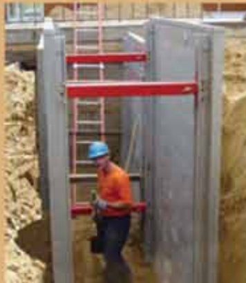
Aluminum Trench Shields