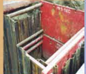
Overlap Sheet Pile