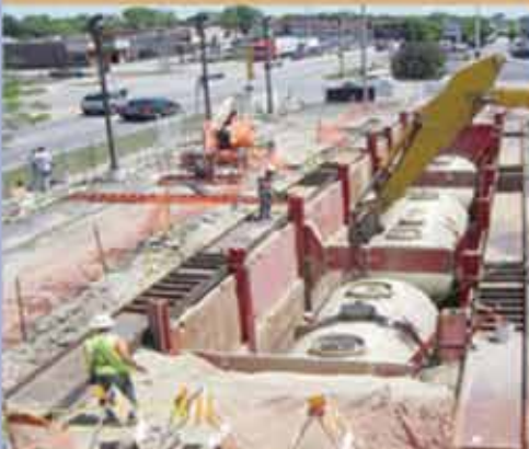
Slide Rail Systems