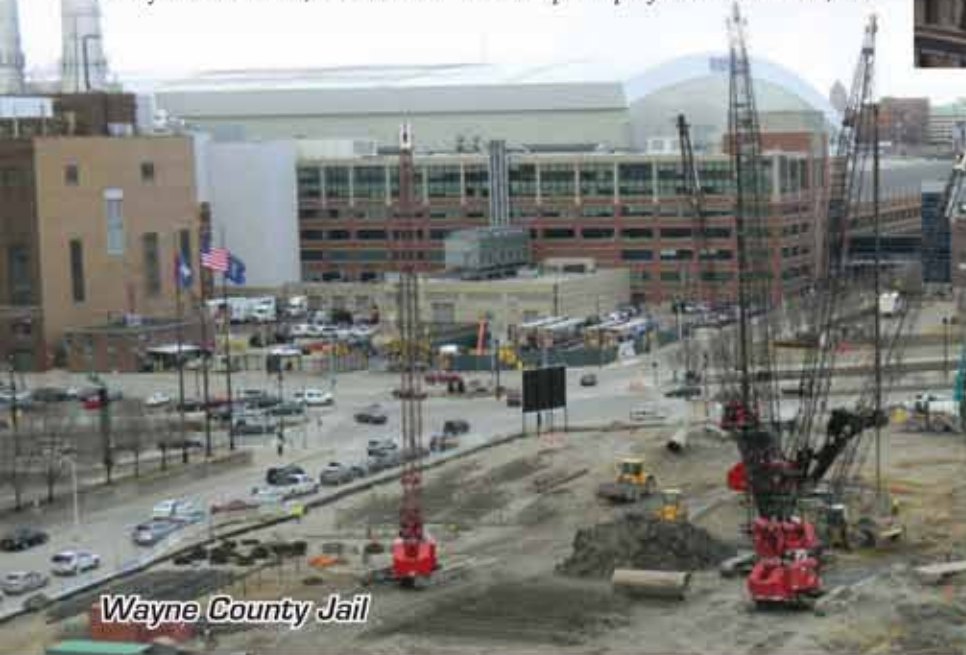
Wayne County Jail