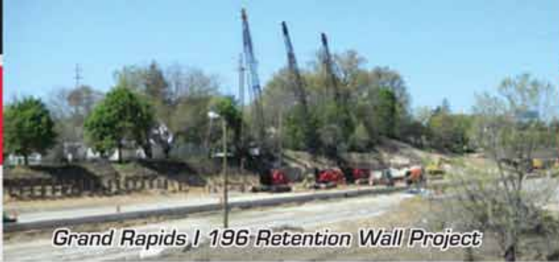
Grand Rapids I-196 Retention Wall Project