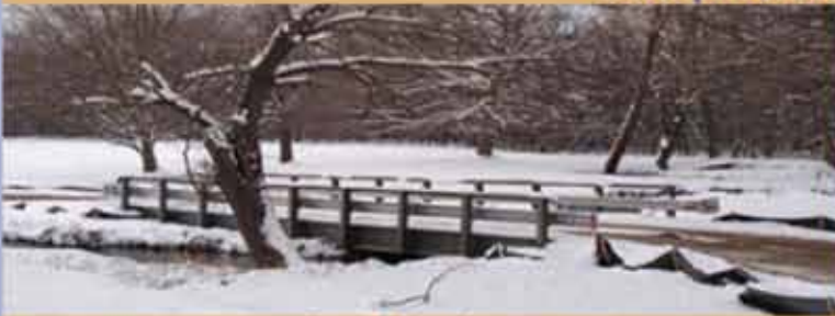
Versa Bridge Systems