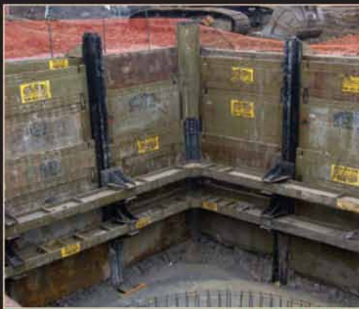
Slide Rail System

Call us for Factory-Direct Sales and Rentals