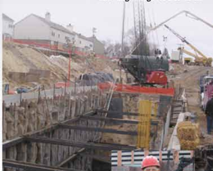
Sterling Heights Sinkhole