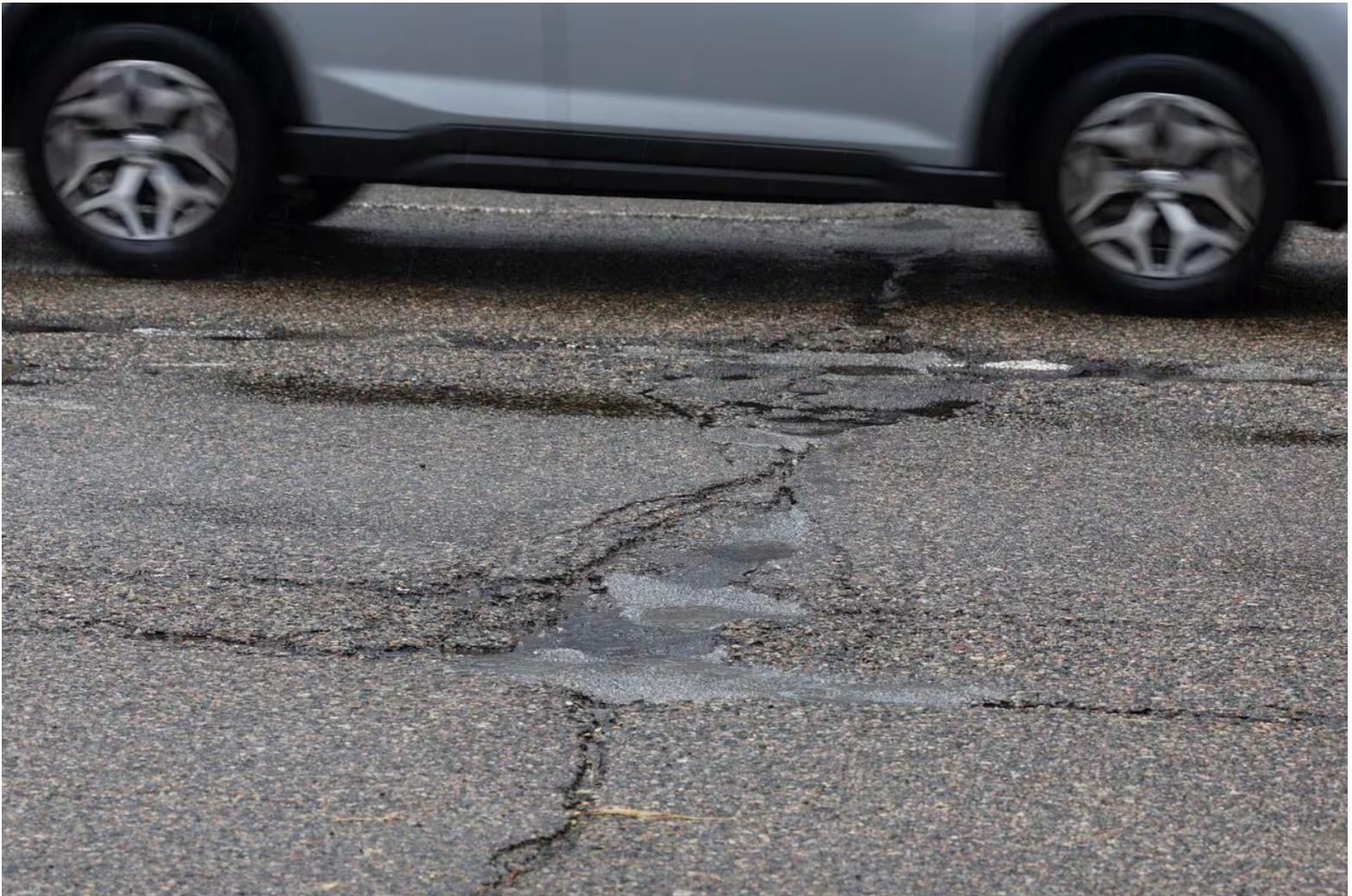
Potholes along West Michigan Avenue in downtown Kalamazoo, Michigan on Monday, March 6, 2023.

Updated: Feb. 01, 2024, 8:48 p.m. | Published: Feb. 01, 2024, 4:25 p.m.